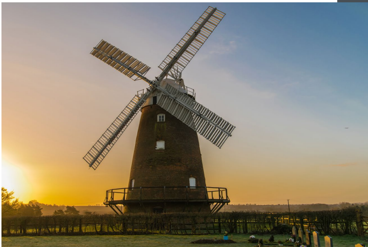
John Webb's Windmill Thaxted