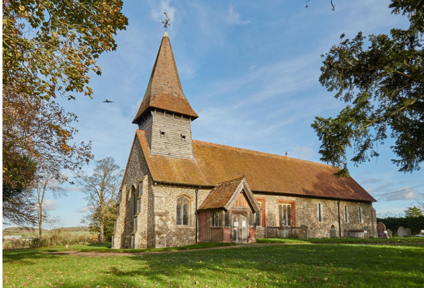
St. Marys Mews Broxted